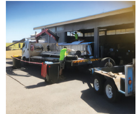
The installation of new doors on the Workshop.