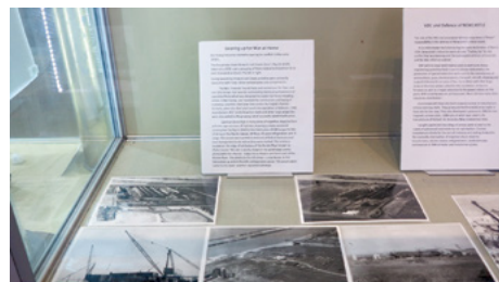
Newcastle Industry and VDC