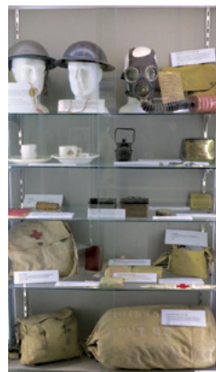
Soldier's Kit and First Aid

Members of the Museum Team took responsibility for researching and developing the cabinet displays: